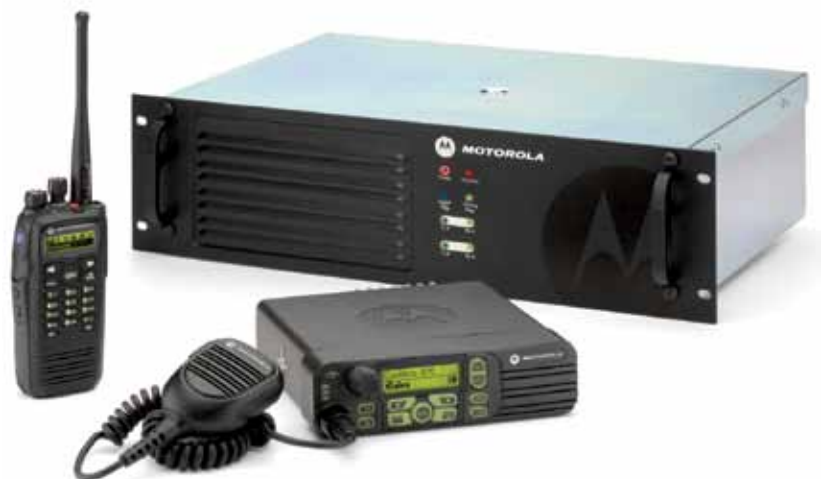
MOTOTRBO™ portable, mobile and repeater.

With an effective system to provide task management, track progress and improve responsiveness of their caregivers, healthcare providers can perform their work quickly and accurately, and avoid costly errors. They can enhance clinical performance and improve the delivery of patient care.