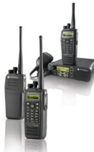
Motorola MOTOTRBO XPR Digital Radios